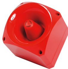
Klaxon Nexus Sounder