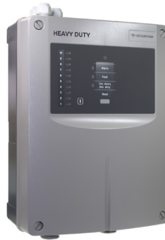
SecuriSmoke Heavy Duty ASD-535