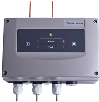
SecuriHeat ADW-535 LHD