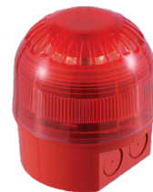
Klaxon Sonos Sounder/Beacon