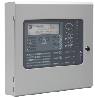
Advanced Intelligent 1-Loop FACP