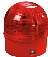
XP95 Open-Area Sounder Beacon

• DISCLAIMER: Although the contents of our product literature have been prepared with the greatest care, Technoswitch can accept no liability whatsoever for any direct or indirect damages of any kind that may arise due to either errors or omissions in them, or amendments to products or other specifications following publication. © Technoswitch (Pty) Ltd