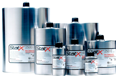
Stat-X Aerosol Range