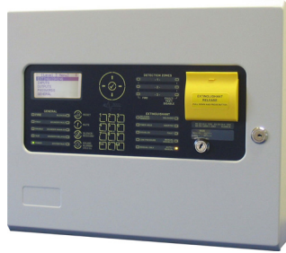
3 Zone Fire/Extinguishant Panel (EN Approved)