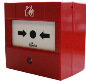
Discovery Manual Call Point