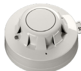
XP95 Optical Detector