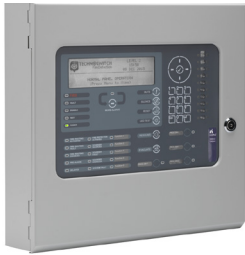
1 Loop Intelligent Fire Alarm Control Panel