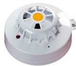
XP95 Heat Detector