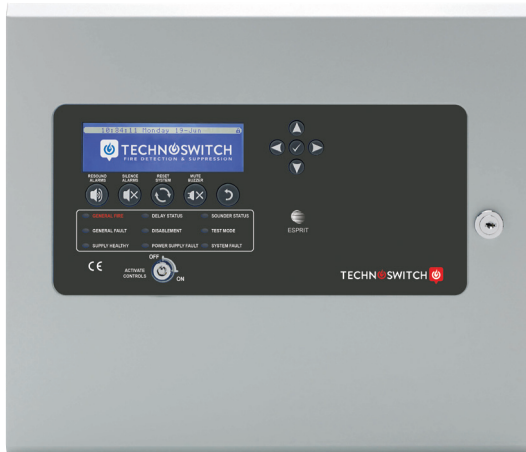
ESPRIT INTELLIGENT REPEATER PANEL