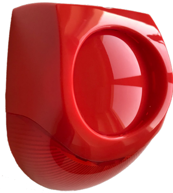
SENSOMAG INDOOR SOUNDER/BEACON