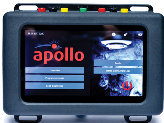
APOLLO TEST SET