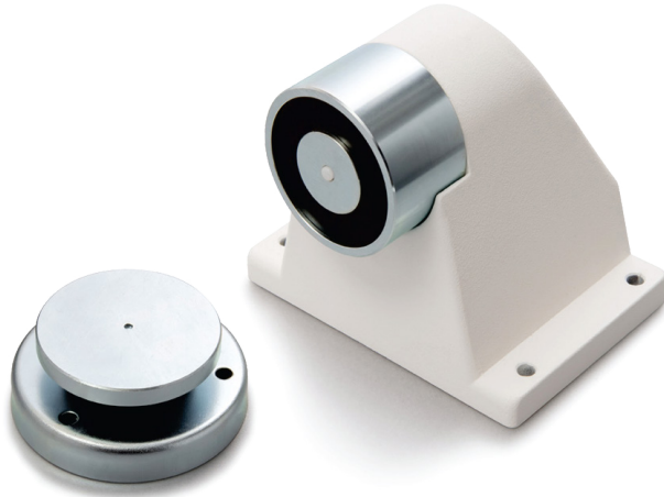
FLOOR-MOUNT FIRE DOOR HOLDER