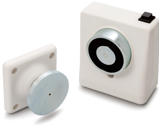
DOORMOUSE WALL-MOUNT ELECTROMAGNETIC FIRE DOOR HOLDER