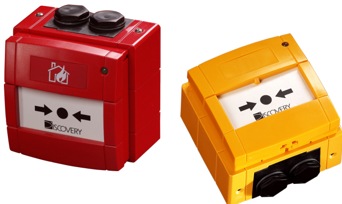
DISCOVERY WATERPROOF MANUAL CALL POINT WITH ISOLATOR