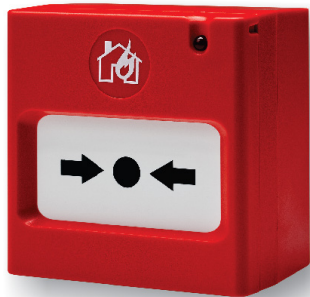
SENSOMAG SURFACE MOUNTED CALL POINT WITH LED