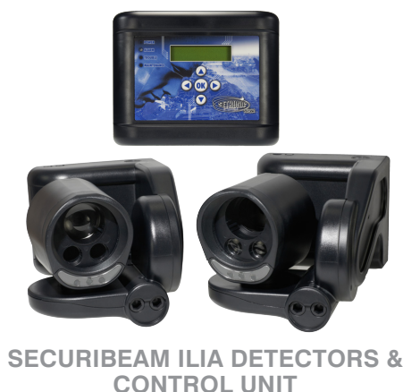
SECURIBEAM ILIA DETECTORS & CONTROL UNIT