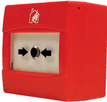
SYCALL MANUAL CALL POINT