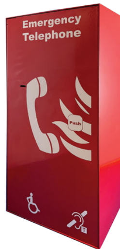
TYPE A OUTSTATION FIRE TELEPHONE HANDSET